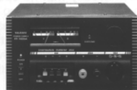
FP-1030A AC Power Supply (30 A)

About this brochure: we have made this brochure as comprehensive and factual as possible. We reserve the right, however, to make changes at any time in equipment, optional accessories, specifications, model numbers, and availability. Precise frequency range may be different in some countries. Some accessories shown herein may not be available in some countries. Some information may have been updated since the time of printing; please check with your Authorized Yaesu Dealer for complete details.