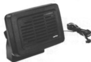
MLS-100 High-Power External Speaker