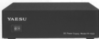
FP-1023 (U.S.A. only) AC Power Supply (23 A) FP-1025A (U.S.A. only) AC Power Supply (25 A)