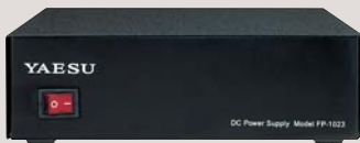
FP-1023 (U.S.A. only) AC Power Supply (23 A) FP-1025A (U.S.A. only) AC Power Supply (25 A)