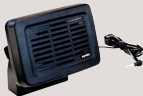
MLS-100 High-Power External Speaker