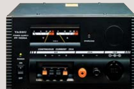
FP-1030A AC Power Supply (30 A)

About this brochure: we have made this brochure as comprehensive and factual as possible. We reserve the right, however, to make changes at any time in equipment, optional accessories, specifications, model numbers, and availability. Precise frequency range may be different in some countries. Some accessories shown herein may not be available in some countries. Some information may have been updated since the time of printing; please check with your Authorized Yaesu Dealer for complete details.